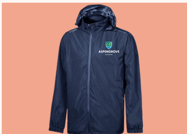
Dalton Jacket Marine or Black Options

The following outerwear can be purchased through O'Neills.