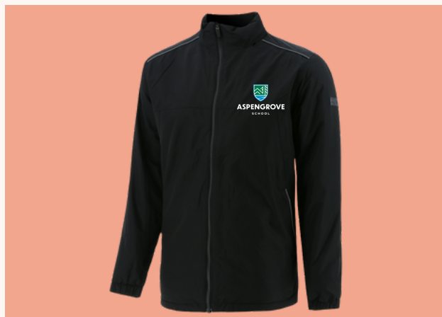
Sloan Jacket Marine or Black Options

*Non-Aspengrove branded hoodies are not considered outerwear and cannot be worn during school hours. In addition, jackets must be removed and stored away when not outside (ie. jackets are not permitted to be worn during class time).